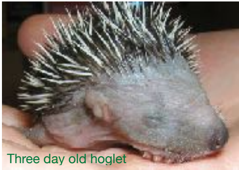
Three day old hoglet