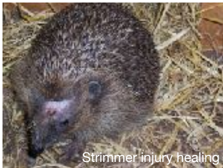
Strimmer injury healing