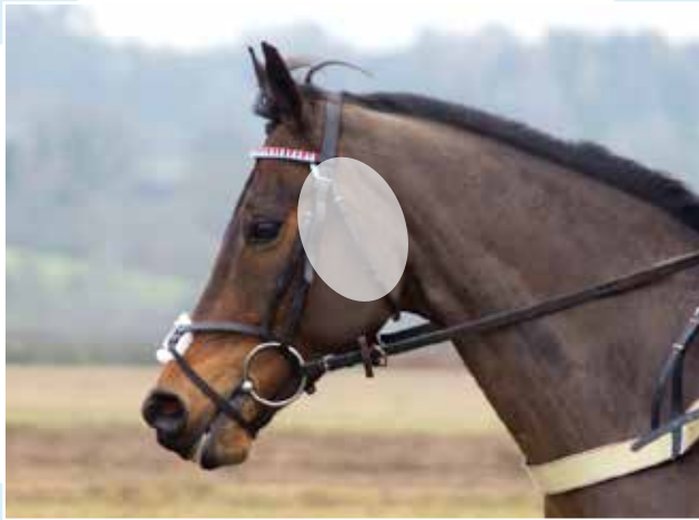
The shaded area shows the location of the guttural pouch, a natural hiding place for Strangles. Up to 10% of horses may become persistent carriers of Strangles following an outbreak.