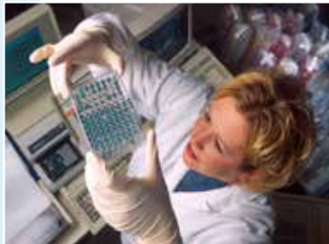
SAC Veterinary Services uses tests that have been developed by The Animal Health Trust, a leading Strangles authority.